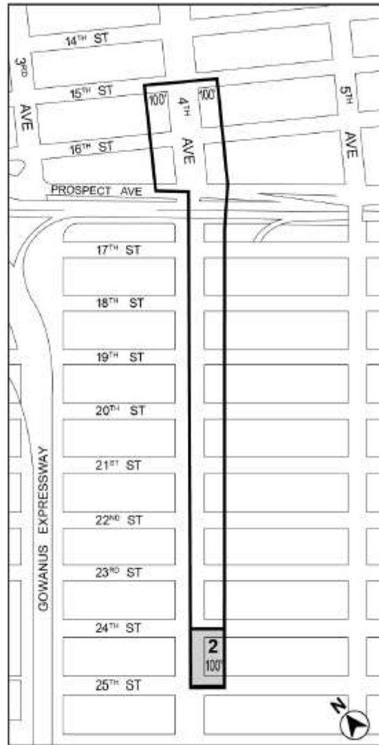
Map 1 – [Date of adoption]