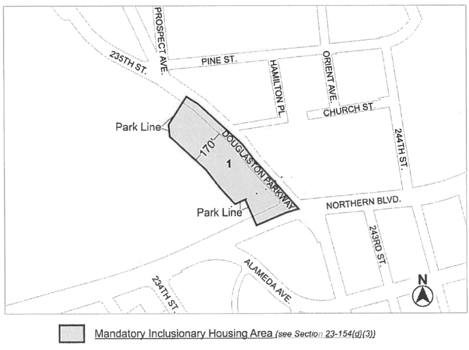
Area 1 — [date of adoption] — MIH Program Option 1 and Option 2

Portion of Community District 11, Queens