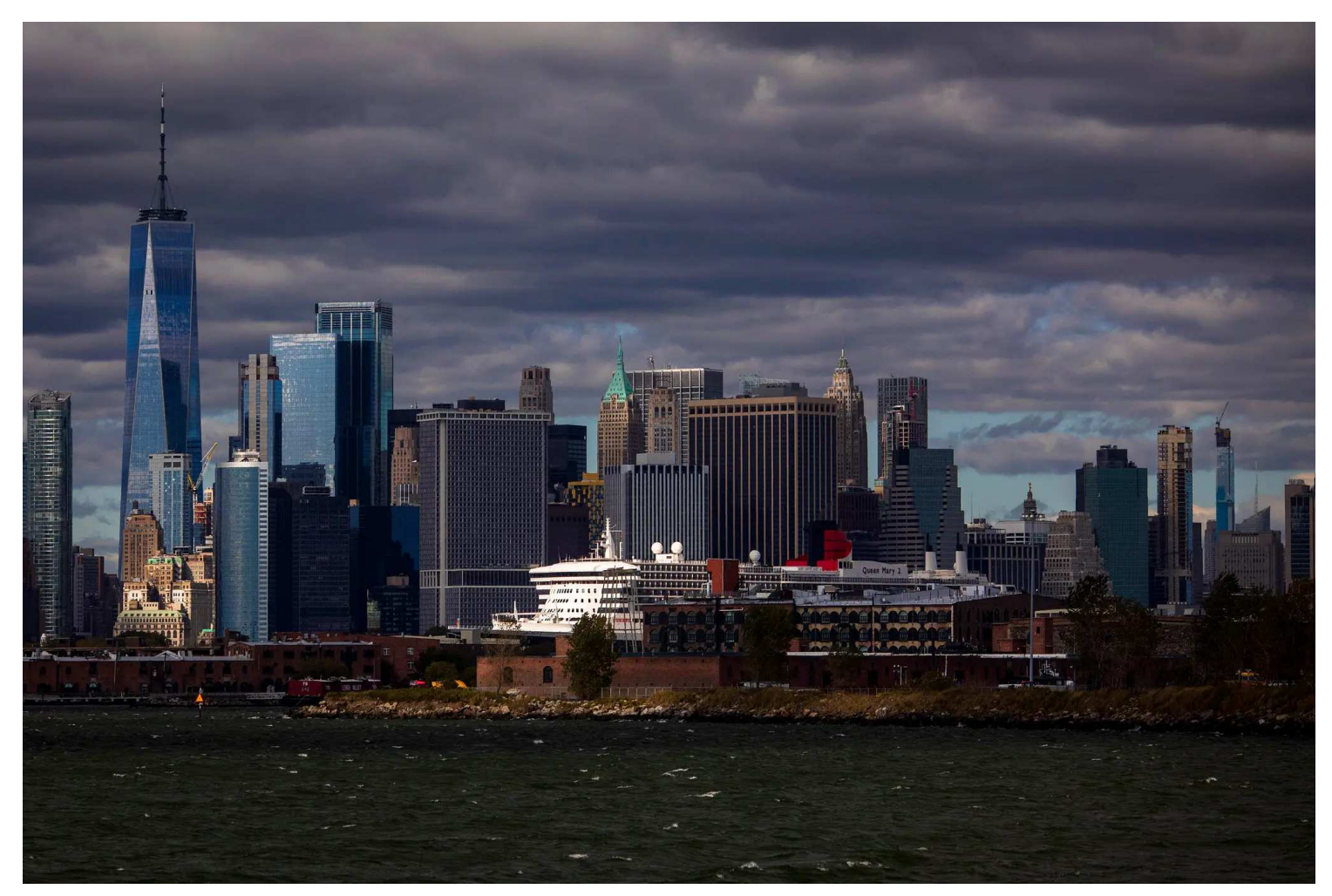
Brooklyn is the home port of the Queen Mary 2, the only ship that has easy access to shore power there.

Nonetheless, the cruise industry is big business, and the city seems intent on expanding it. By the end of 2019, 35 cruise ships will have docked at the Brooklyn terminal; 179 will have docked in Manhattan. The city estimates that cruises brought one million visitors to New York in 2018, and $228 million in spending to the local economy in 2017.