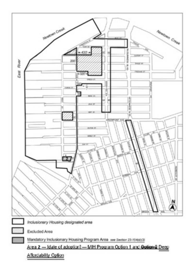
Portion of Community District 1, Brooklyn