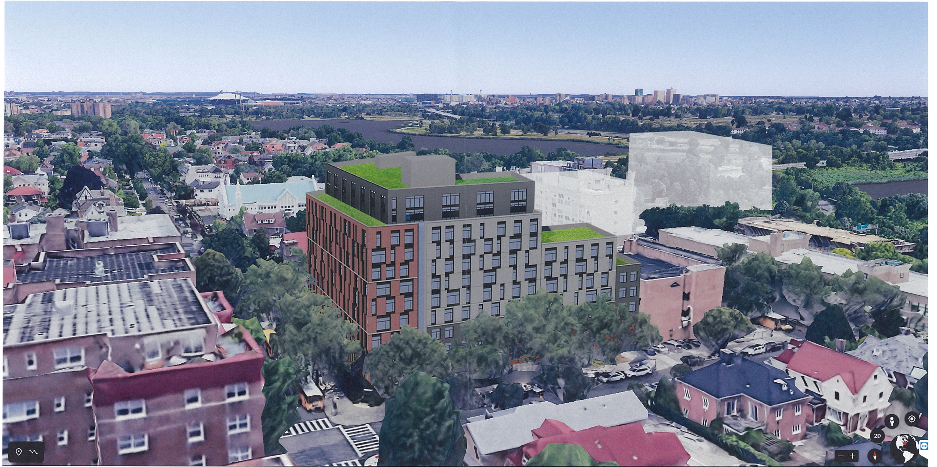
BIRD'S EYE VIEW FROM SOUTHWEST