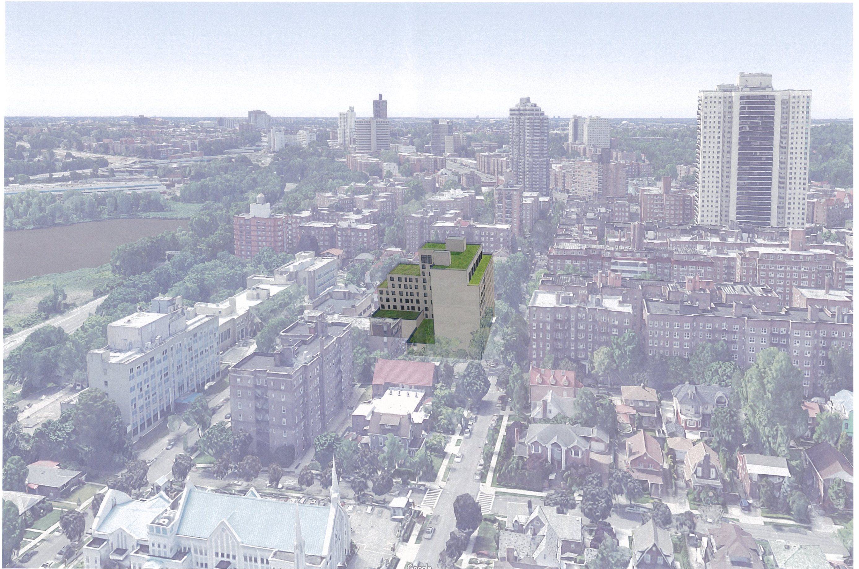
BIRD'S EYE VIEW FROM NORTHWEST