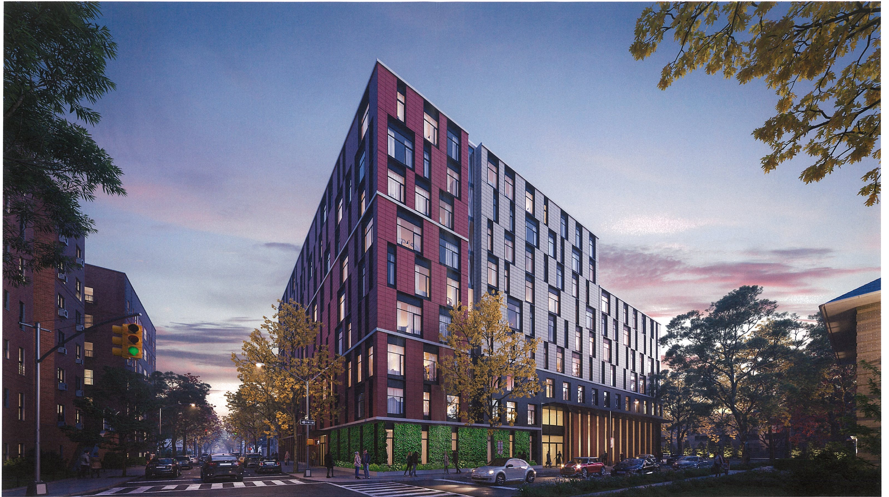
VIEW FROM SOUTHWEST