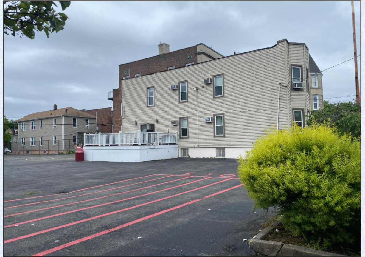
View northwest on Zerega Avenue to the accessory parking lot, including the southeast façade of the two-story house at 1651 Zerega Avenue