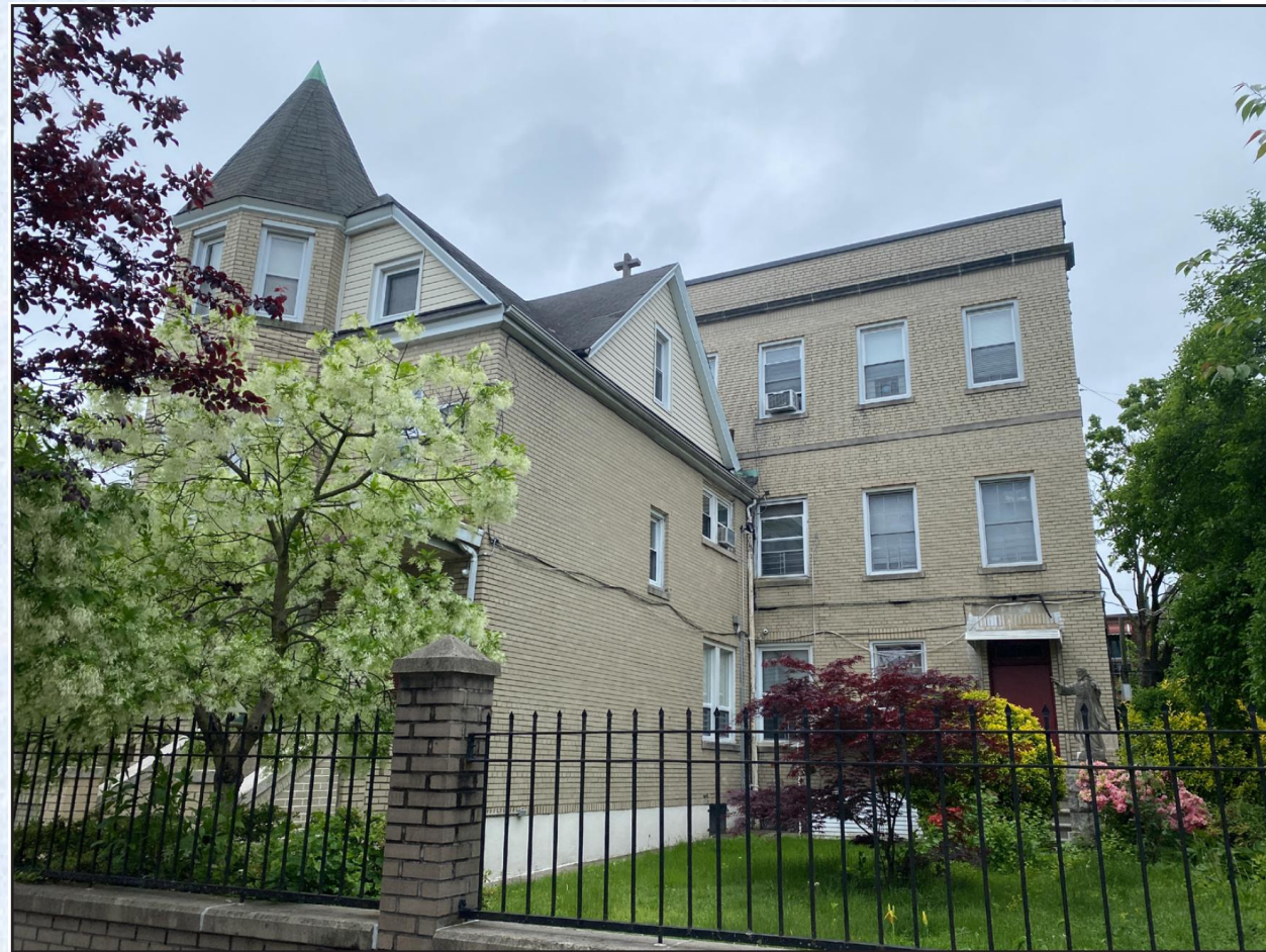
View southwest on Zerega Avenue to the three-story house with a three-story school addition at 1651 Zerega Avenue (p/o Lot 78)