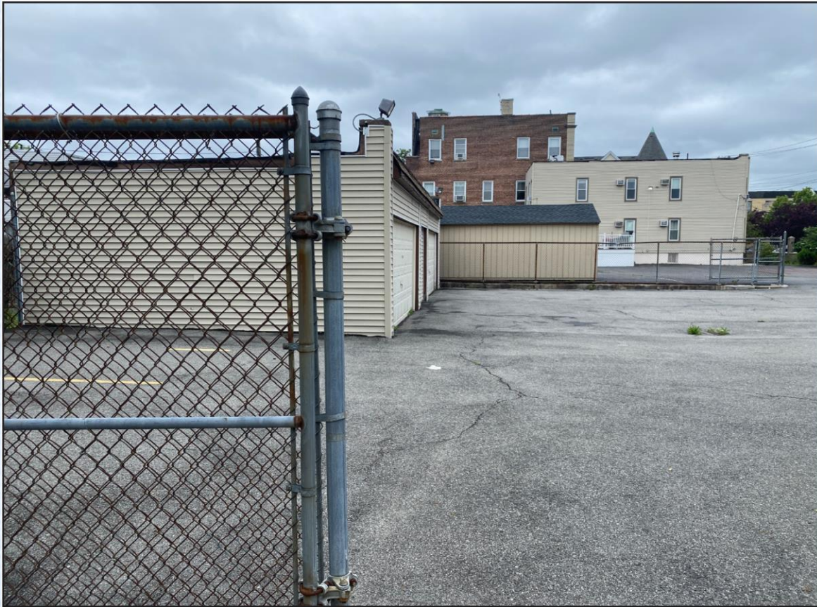
View northwest on St. Raymond Avenue to the one-story garage at 1631 Zerega Avenue (Lot 87)