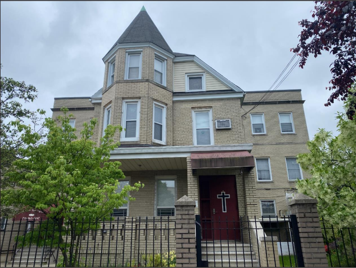
View southwest on Zerega Avenue to the three-story house with a three-story school addition at 1651 Zerega Avenue (p/o Lot 78)