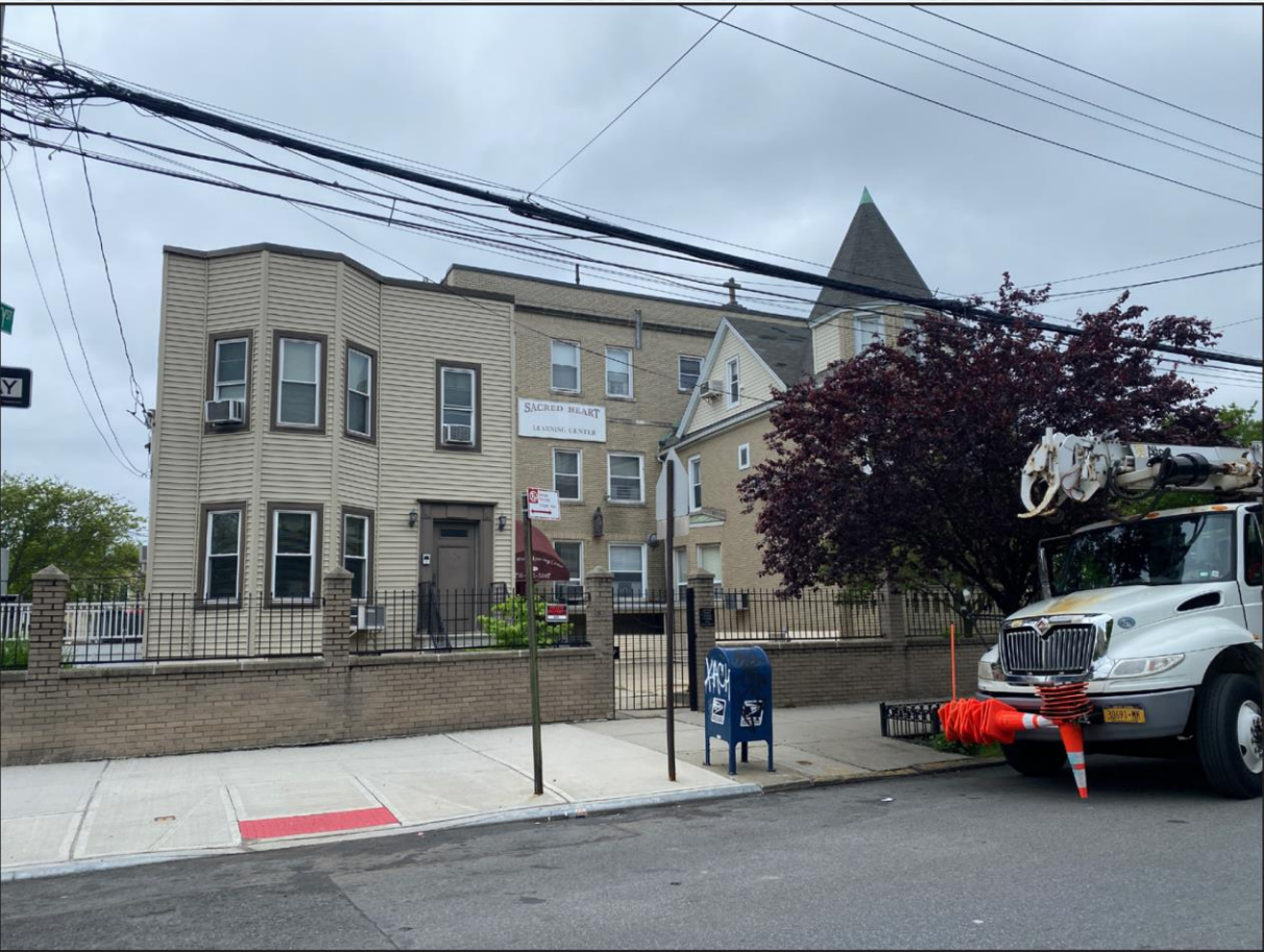
View southwest on Zerega Avenue to the two-story house at 1651 Zerega Avenue (p/o Lot 78)