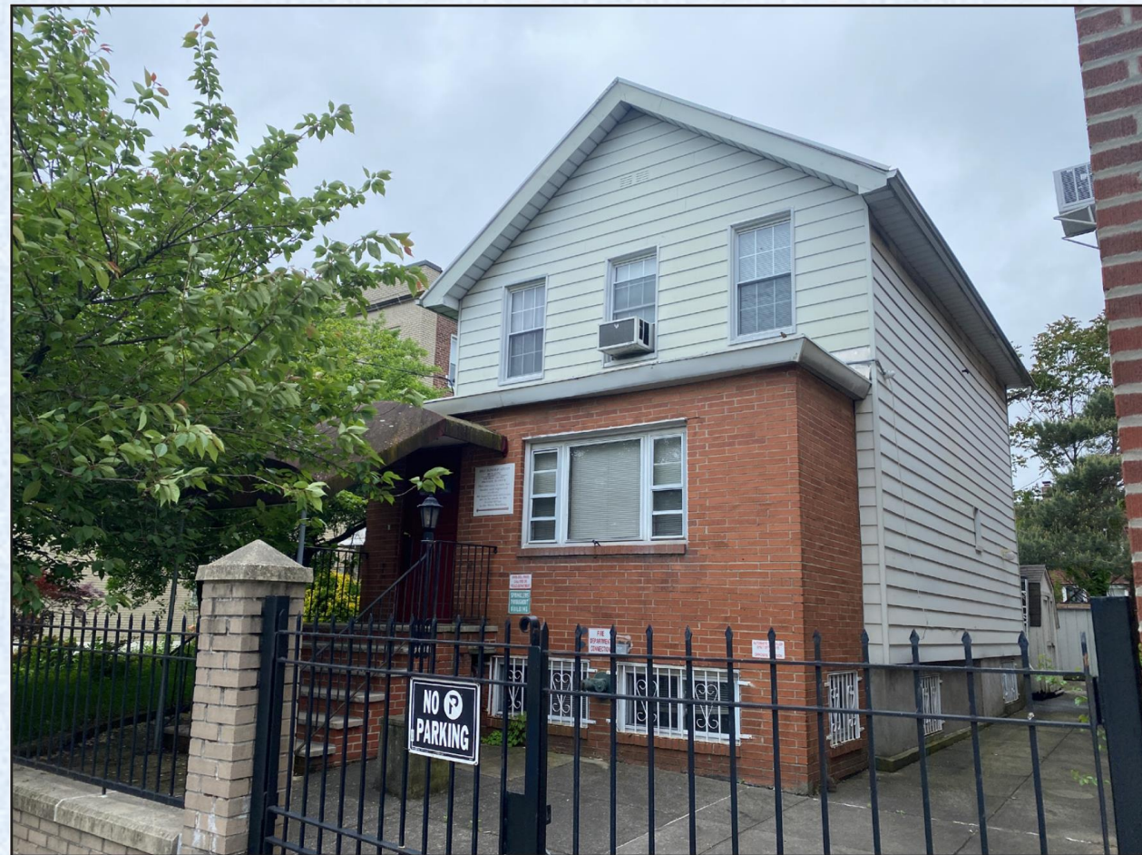
View south on Zerega Avenue to the two-story house at 1659 Zerega Avenue (Lot 75)