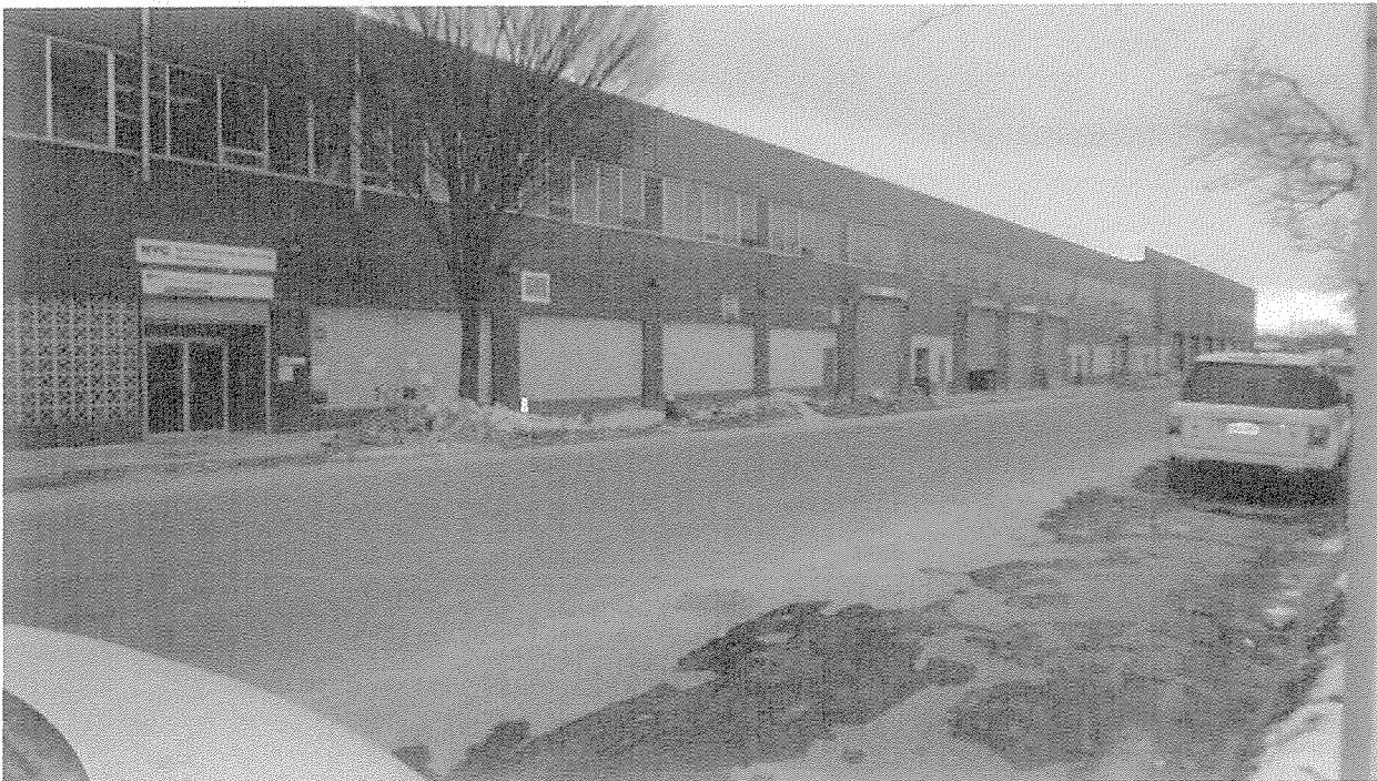
#2 View looking south of project site at 10300 Foster Avenue