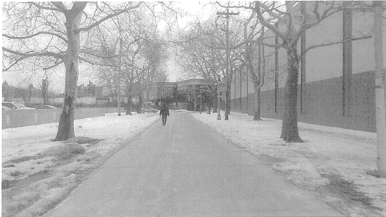
#1 View looking south east of project site at 10300 Foster Avenue