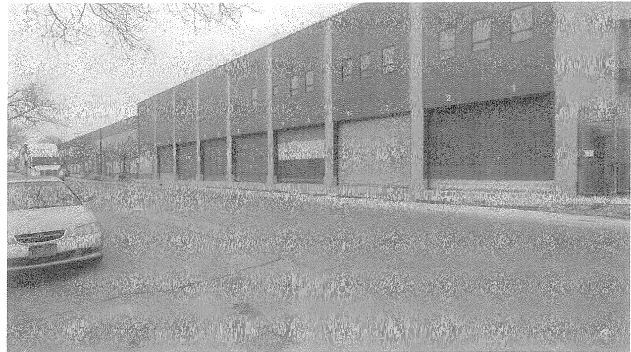
#3 View looking east of project site at 10300 Foster Avenue