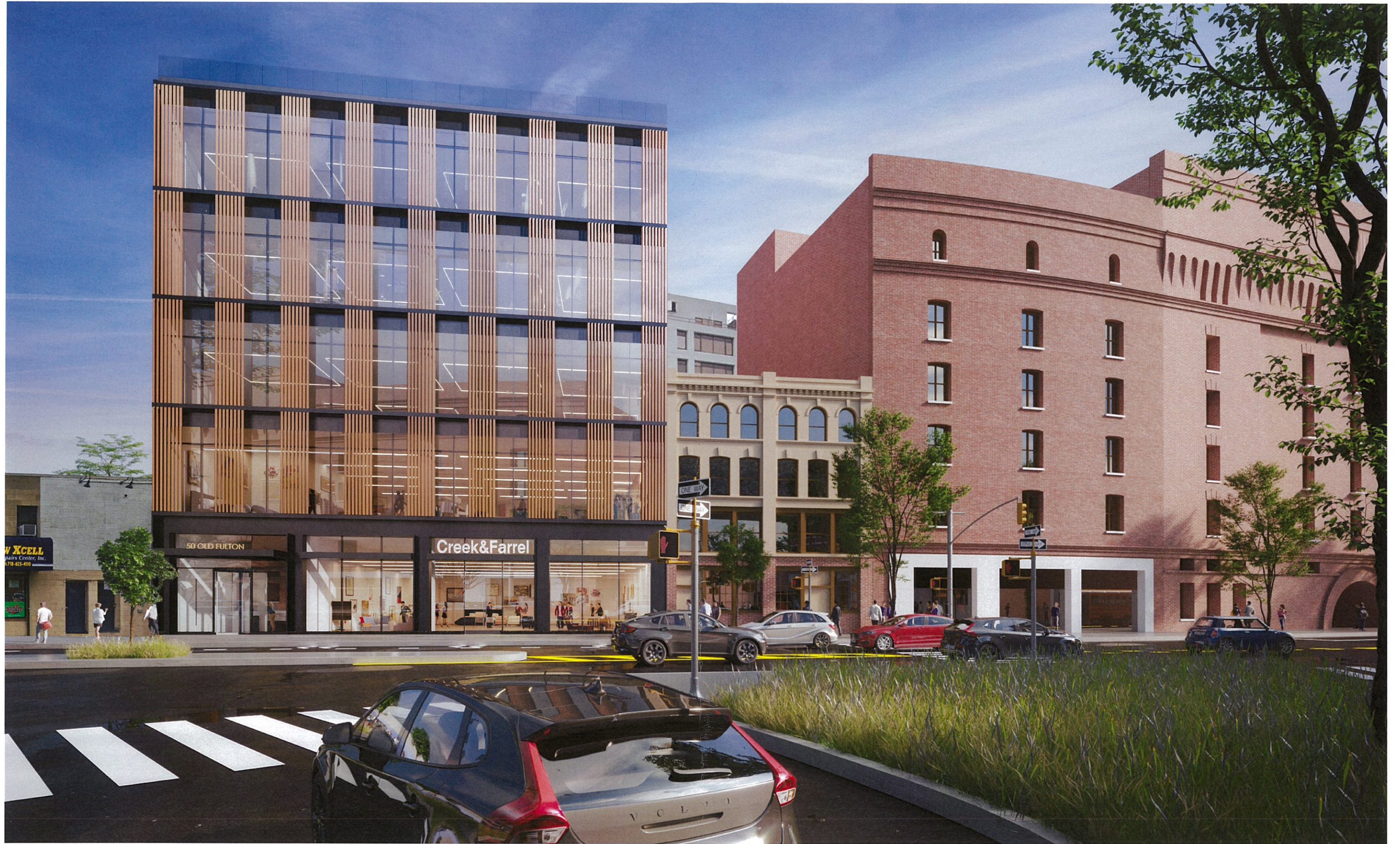
50 OLD FULTON STREET, BROOKLYN, NEW YORK 03.04.2020