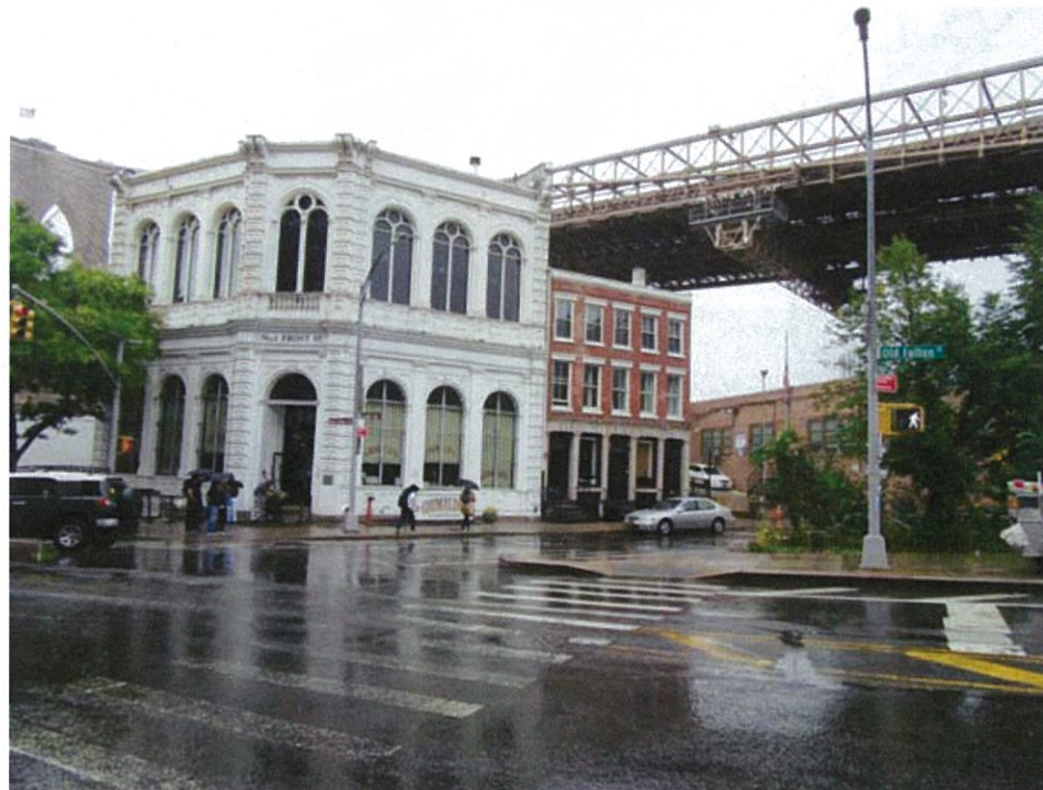
View of the intersection of Old Fulton Street and Front Street facing north from the Development Site.