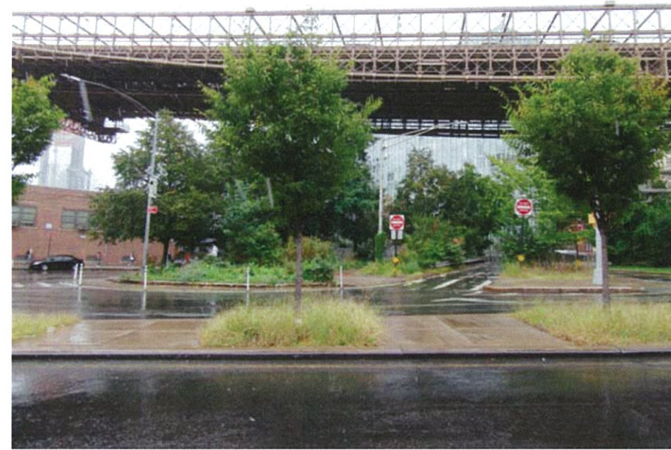
View of the north side of Old Fulton Street facing north from the Development Site.