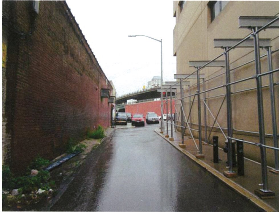
View of Doughty Street facing east (Development Site at left).