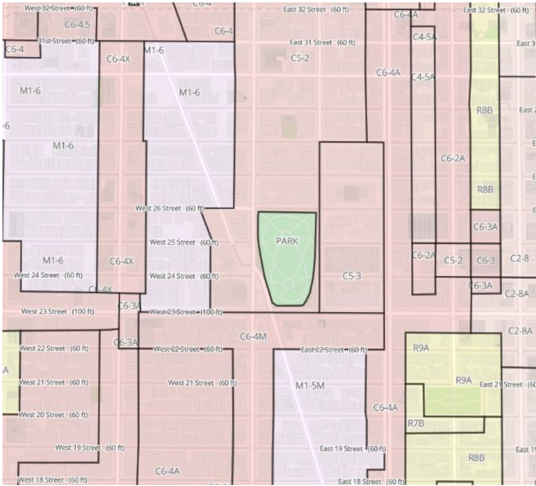
Exhibit D - Land Use Map