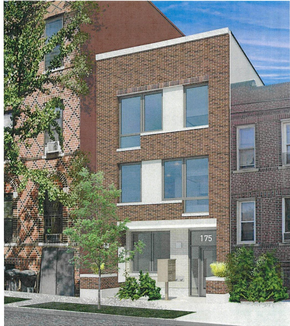
175 Milford Street, Rendering