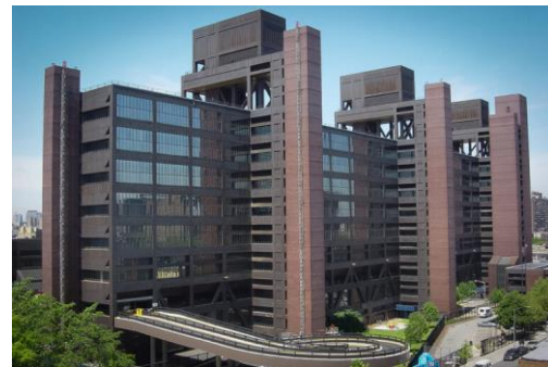
Woodhull Hospital, an unlisted property operated by H+H.