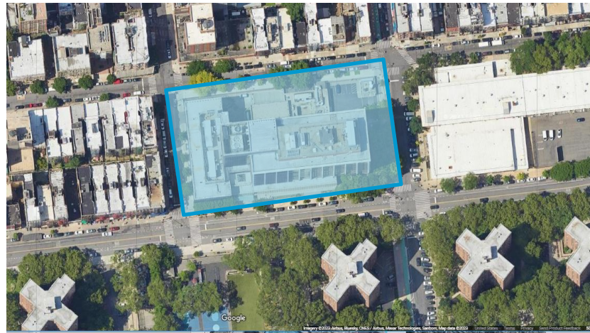
Gouverneur, an unlisted property operated by H+H.