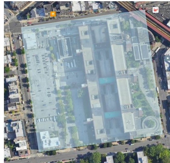
Woodhull Hospital, an unlisted property operated by H+H.