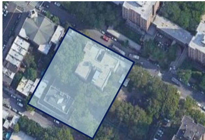
Lincoln Recovery Center, an unlisted property operated by H+H.

Operated from 1931-2012. Currently vacant.