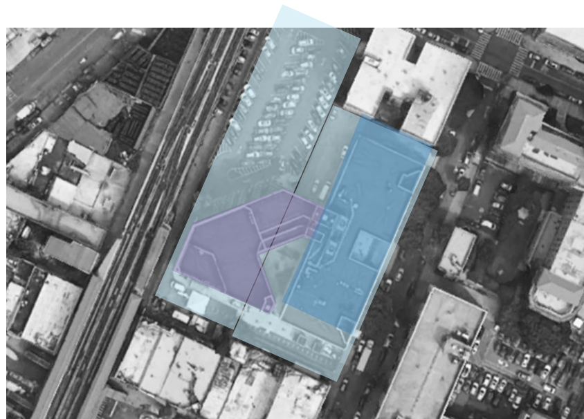
Gotham/Morrisania, an unlisted property operated by H+H.