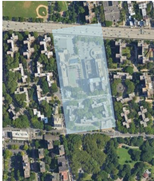
Gotham/ Cumberland, an unlisted property operated by H+H.