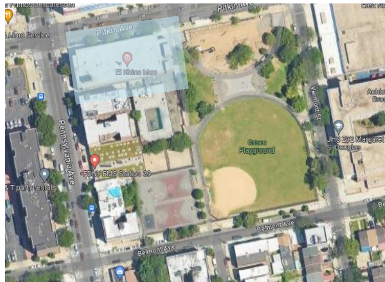
Gotham/ East New York, an unlisted property operated by H+H.