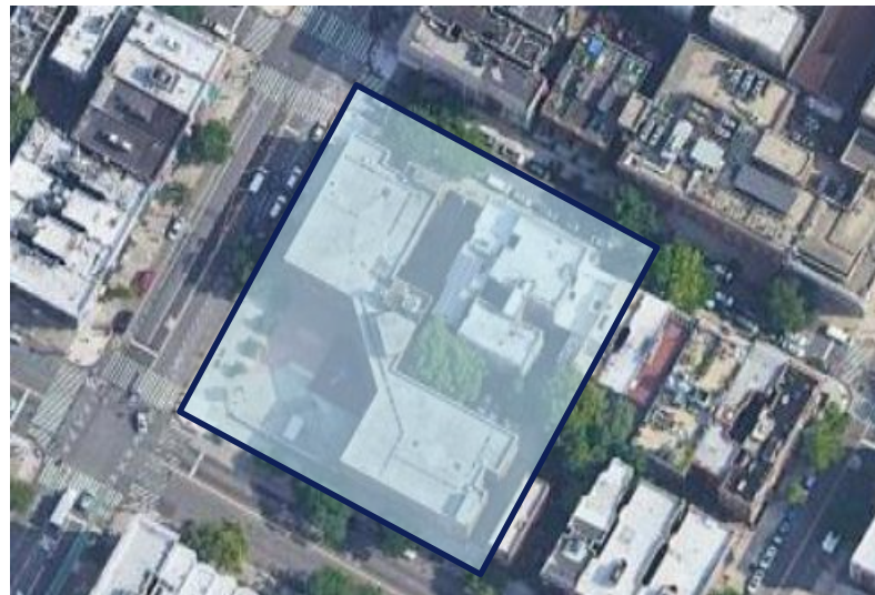
Lower Washington Heights Health Center, an unlisted property operated by H+H.

Services Offered: No H+H services offered; H+H does not occupy this space