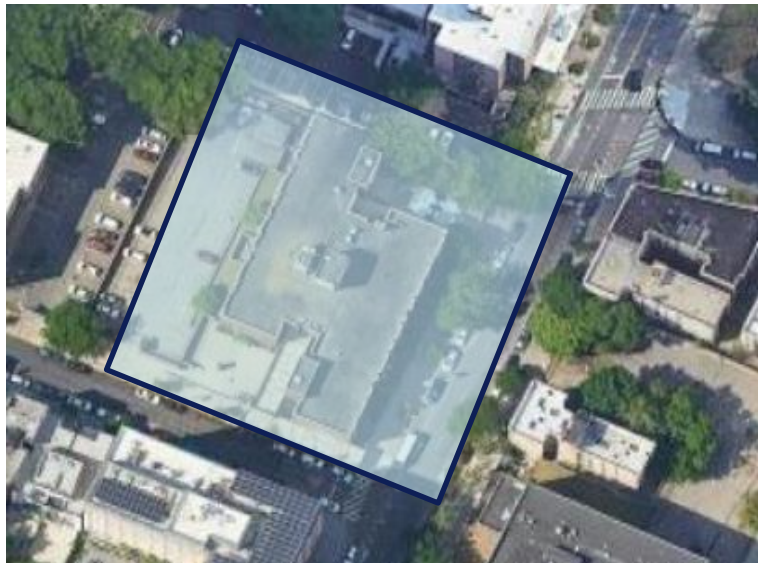
Gotham/Belvis, an unlisted property operated by H+H.