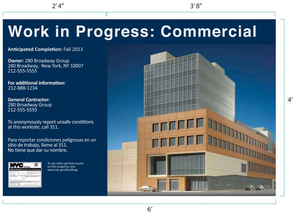
FIGURE 3301.9.1.4(2) FENCE PROJECT INFORMATION PANEL LAYOUT