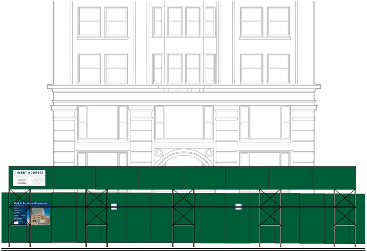
FIGURE 3301.9.2.2 PANEL POSTING ELEVATION DIAGRAM