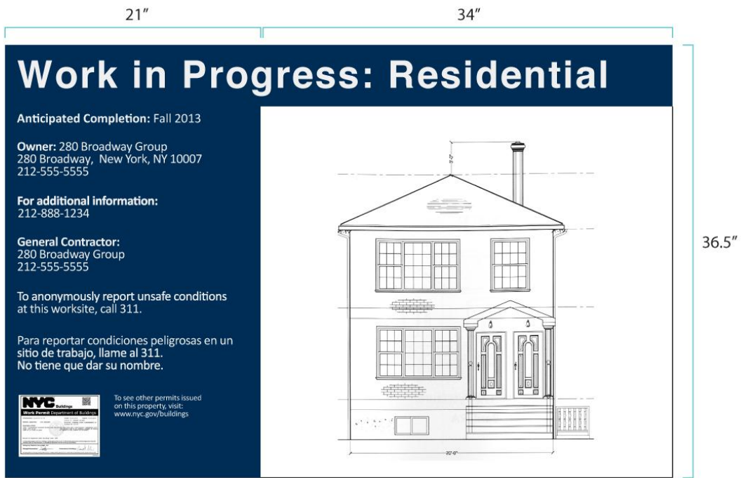
FIGURE 3301.9.1.4(3) FENCE PROJECT INFORMATION PANEL LAYOUT FOR SMALL LOTS