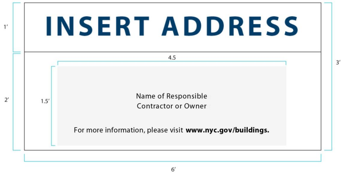
FIGURE 3301.9.2.1(1) SIDEWALK SHED PARAPET PANEL LAYOUT