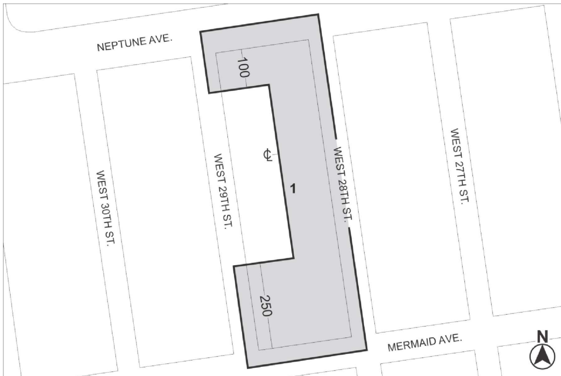
Map 2. [date of adoption]